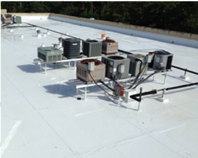
TPO Roofing System