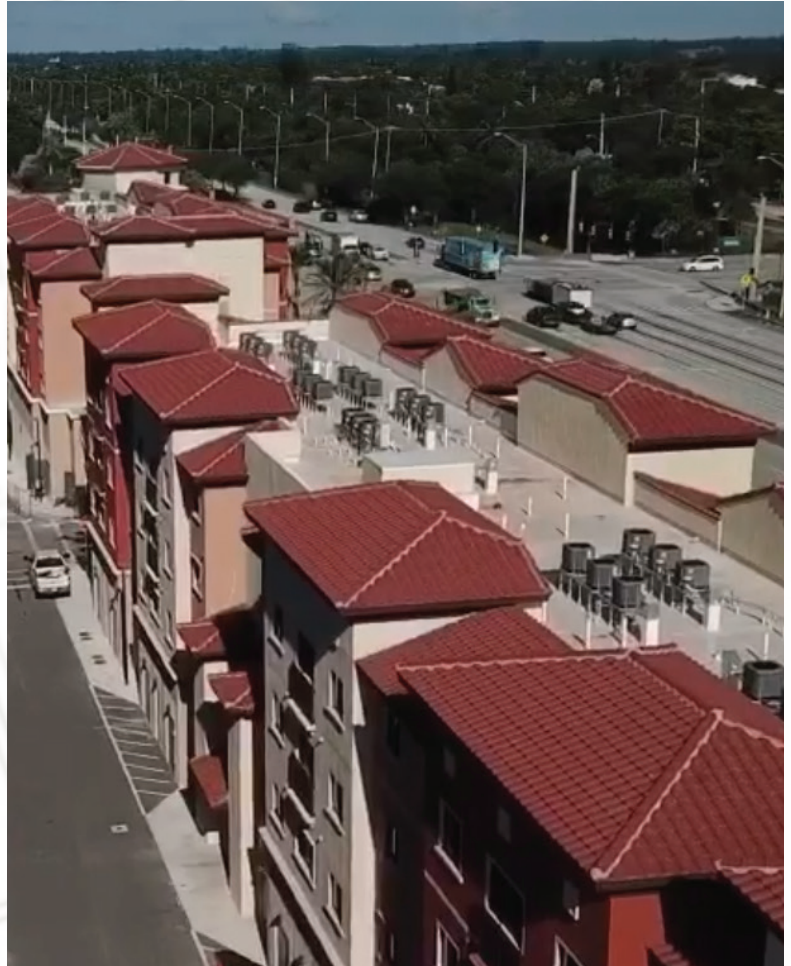
Tile & Flat Roofing System

The integrity of a concrete tile roofing system, TPO, roof coating, and asphalt shingle roof can be reinforced if installed with the correct two-ply secondary water barriers. Universal Construction applies the best quality roof underlayment for steep slope roofs with warranties for 25 years or more.