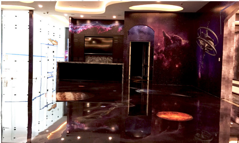
Custom Vinyl Wrap, Epoxy Poured Floor

These things may seem minor, but they are issues that add up to millions.