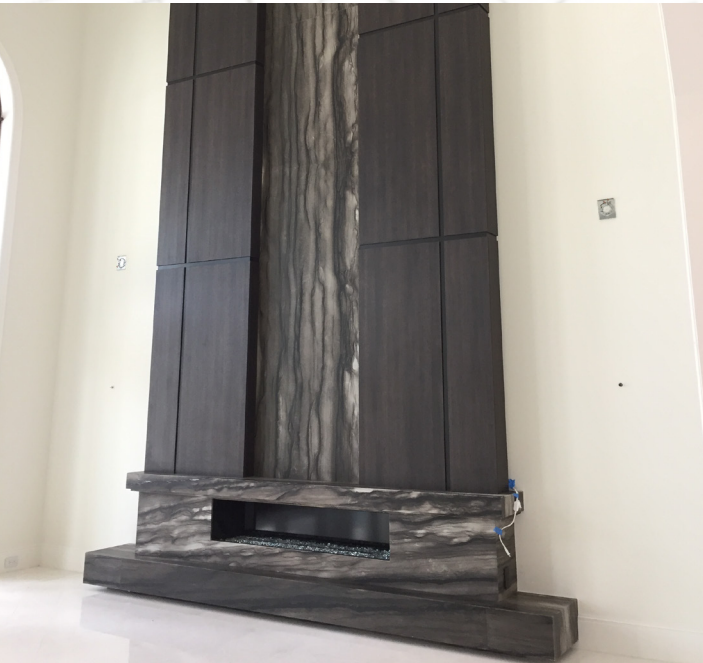
Custom Gas Fireplace