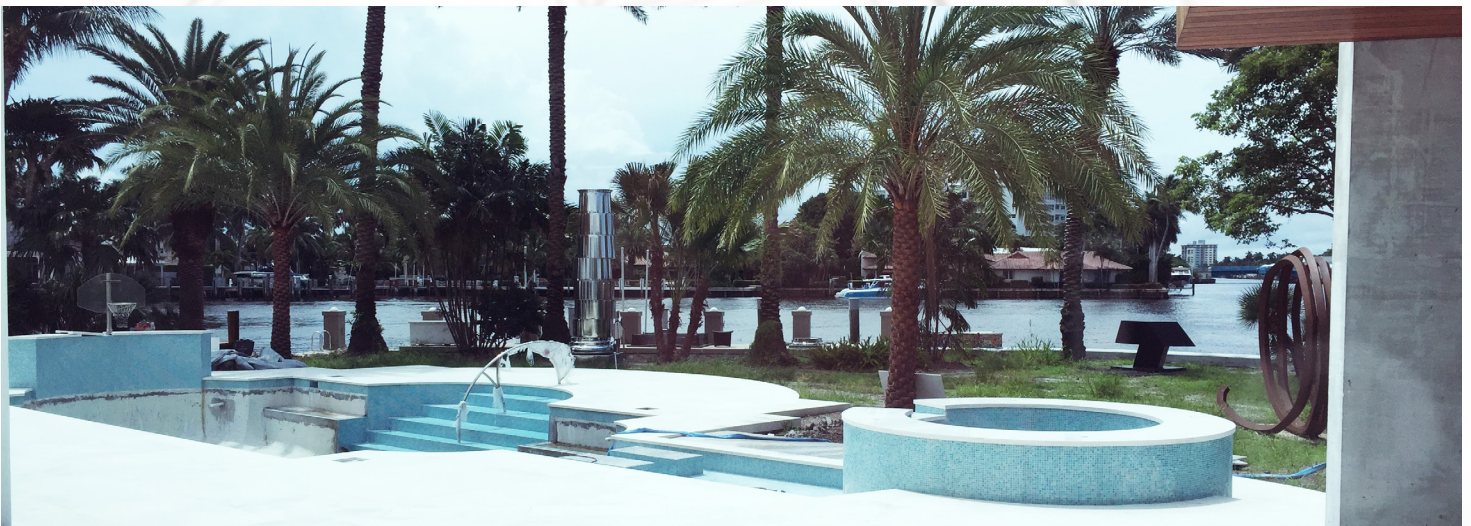
Custom Pool & Patio