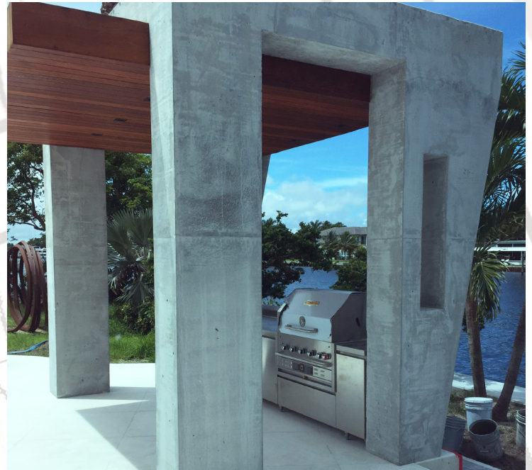
Custom Outdoor Barbecue