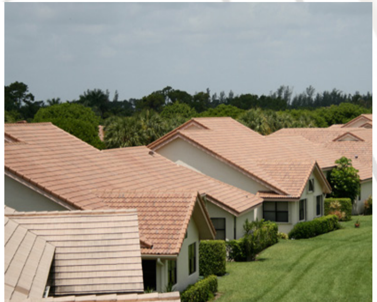
Association Roofing Project