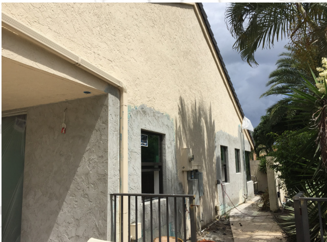
Residential Textured Stucco