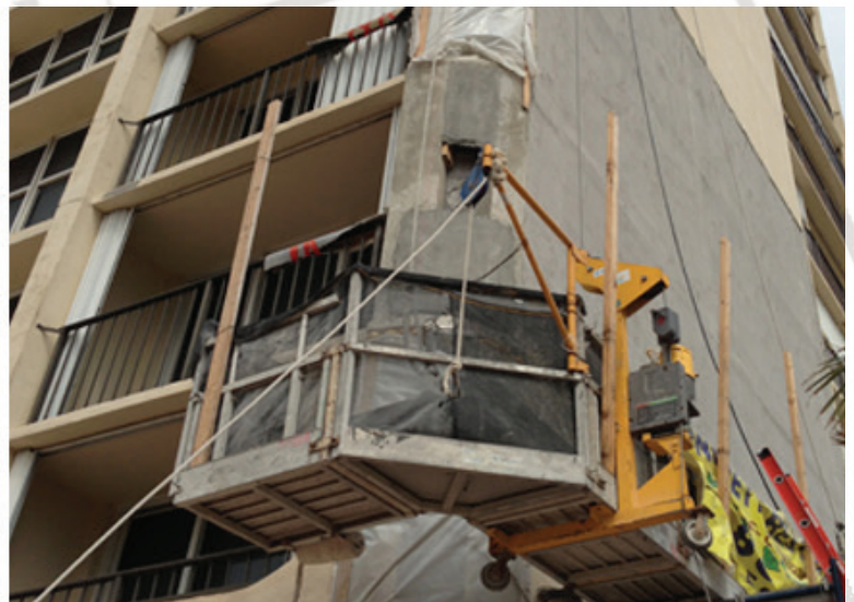
Concrete Restoration Progress Photos