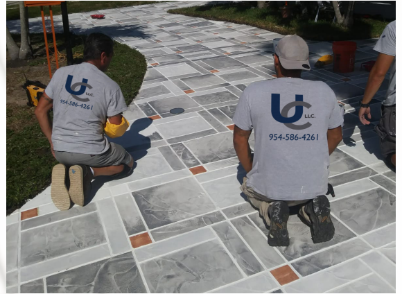
Driveway, Pool, and Patio Resurfacing

At Universal Construction our goal is to assist you in the designing and building of your project, from all phases of your new custom home construction, Concrete high-rise restoration. No matter the size of the job at hand, we always provide a free detailed proposal clearly stating our scope of work. We utilize only the highest quality materials, experienced supervisors, and qualified tradesmen. Our excellent reputation and extensive customer reference list attest to our superior craftsmanship, attention to detail, clear communication, honesty, and integrity.